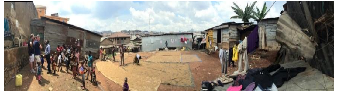
In September 2016 C4C moved to a larger property closer to Kampala