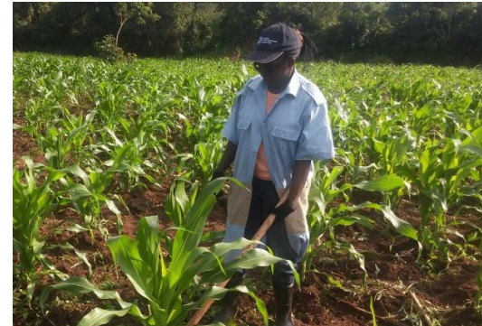
C4C has its' own farm, where is grows food for the children