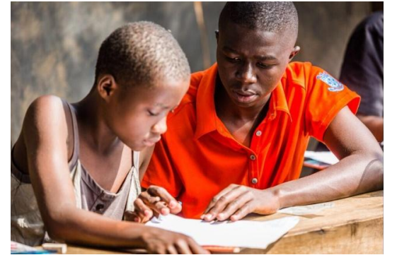
All our children have access to free education